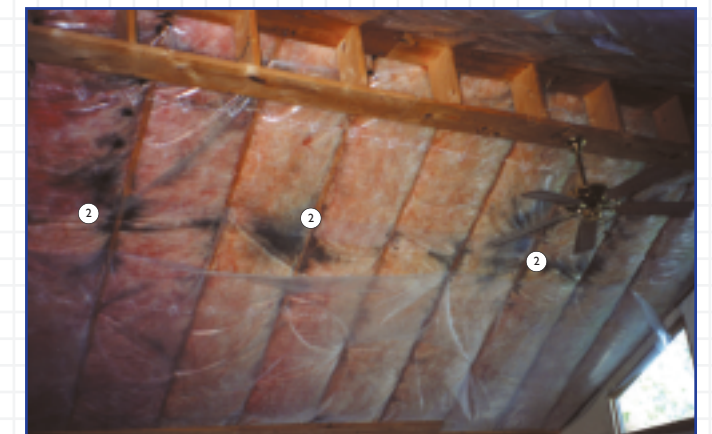
(2) Hot humid interior air had leaked past the poly, through the batt insulation, and come into contact with the cold air in the venting, thus causing condensation and mold.