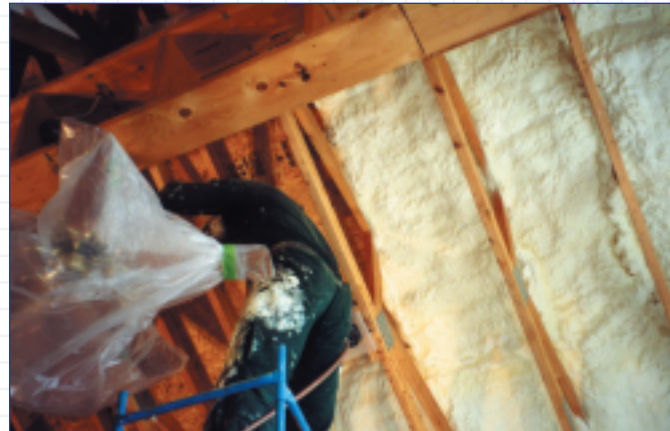
Icynene® is sprayed directly on to the roof deck. There are no air vent channels.

The remaining portion of the attic floor space, approximately 576 sq. ft., was left intact with the original R40 fiberglass batt insulation.