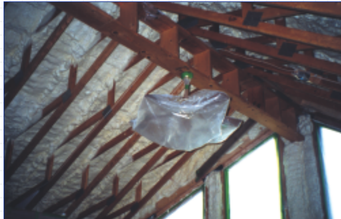
Icynene® is sprayed to a depth of 5 1/2 inches and adheres directly to the roof deck.