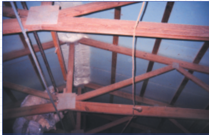
Sealing of the ridge vent with Icynene® Insulation to prevent air leakage.