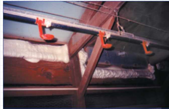
Sealing of the side wall gaps/cracks with Icynene® to prevent air leakage.