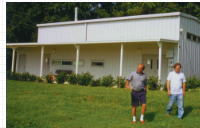
Building 243 at the University of Florida.

The building envelope for this laboratory was a typical commercial steel panel style construction. Controlling air infiltration in this type of structure is difficult at best.