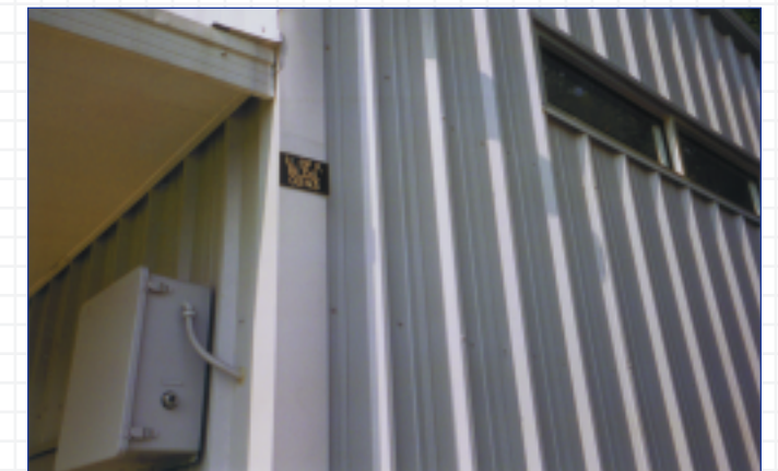
The building utilized standard corrugated steel panel construction.

This project was a collaborative effort between the University of Florida/Energy Extension Service (UF/EES), the Florida Solar Energy Center (FSEC), and the University of Florida/Soil and Water Science Department.