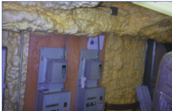
The Icynene® foam was left exposed in the mechanical room, which is located in the upper area of the building.

Icynene® insulation: - 3.5 inches sprayed on walls - 5.5 inches sprayed on underside of roof - metal beams and purlins located in the mezzanine were sprayed to prevent heat exchange.